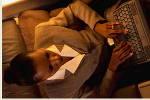
Communication Online is the future

We are unique in the way we do business: We promote the gospel in the way we do business. We demonstrate integrity and trust in our business relations. We provide innovative technology solutions for the Christian community. God has given us the talent of Information Technology and we choose to use our gift in the Christian community. We have IT...Information Technology. We help you manage your website, so you can manage your ministry.